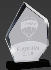
PLATINUM CLUB $250,000 to $499,999 in gross commissions