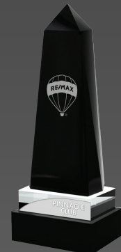
PINNACLE CLUB $2 million+ in gross commissions