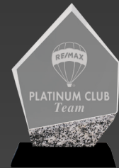
PLATINUM CLUB TEAM $250,000 to $499,999 in gross commissions