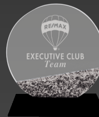
EXECUTIVE CLUB TEAM $50,000 to $99,999 in gross commissions

Team Members are recognized separately with an individual Club Award when their own earnings qualify for one.