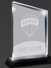
100% CLUB $100,000 to $249,999 in gross commissions