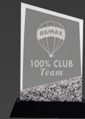
100% CLUB TEAM $100,000 to $249,999 in gross commissions