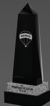
PINNACLE CLUB TEAM $2 million+ in gross commissions