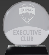
EXECUTIVE CLUB $50,000 to $99,999 in gross commissions

Announced each February, Club Awards are bestowed based on the recipient's total gross commission income (GCI) during the previous calendar year.