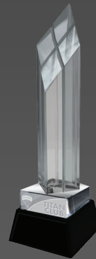
TITAN CLUB $750,000 to $999,999 in gross commissions